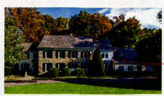
A pair of lawyers got this house for nearly $300,000 under list price.

antitrust lawyer at Crowell & Moring. Days on market: 108. Where: Spring Valley. Style: Colonial. Bragging points: Recently renovated, with eight bedrooms, eight baths, and a pool.